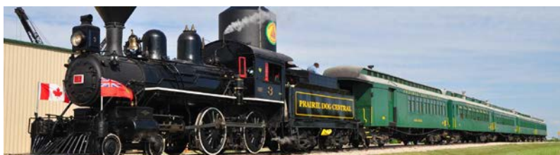
The Buffalo – September 2019